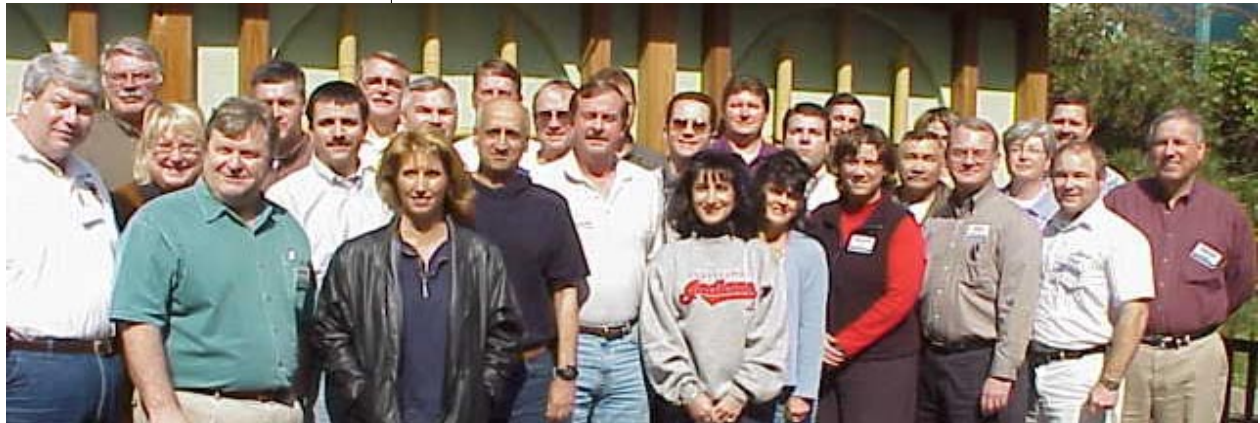
Group

Those who are interested in future course offerings are advised to keep an eye open for the IALEP web page announcement of the next course which is tentatively scheduled for November 2001 in the northeast region.