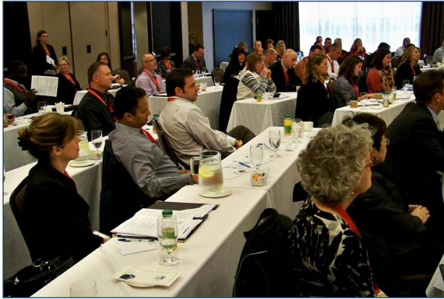
OALEP members at the Fall Symposium at Vaughan, Ontario